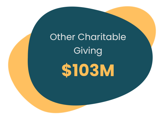
These organizations include operating foundations, certain public charities, and other funders that give grants to a limited pool of recipients, are supported largely through government funding, or are primarily service- or program-

As a coalition of independent public charities, United Way represents a unique segment of the philanthropic community in Maine. Taken together, Maine's United Ways make a significant contribution to statewide charitable giving, totaling over $9.6 million .